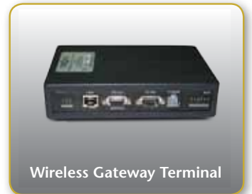
Wireless Gateway Terminal

The Wireless Gateway Terminal (WGT) creates the wireless network that covers the entire forecourt. The WGT forwards the FuelOpass and DataPass data to the forecourt controller (FCC) for approval. During the refueling process, the WGT continues to monitor the Nozzle Reader signal to detect any attempt to remove the nozzle and refuel another vehicle on the same fleet account.